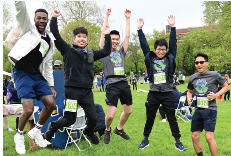
2024 Donor Dash participants

More than a quarter of a million people of all ages have taken part in the Donor Dash since its founding, and our virtual Dash has included participants in more than 30 states plus Ireland. The life-saving message of the Dash reaches millions through media and community participation each year. Proceeds supports programs and activities for donor families and transplant recipients.