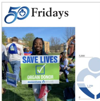
50 Fridays, posted every Friday

50 th Designs: When you share Gift of Life's social posts, 50 th graphics, logos or pictures will automatically appear from the original post. It will look something like the following: