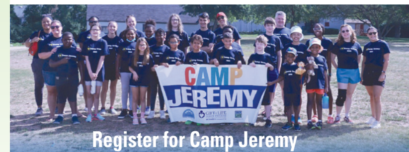
Register for Camp Jeremy