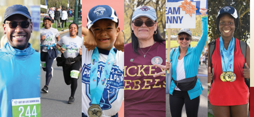
Some of our shining stars from the 2022 Transplant Games and 25th Anniversary Donor Dash.

Thanks to your generosity and support, together we shine and save lives!