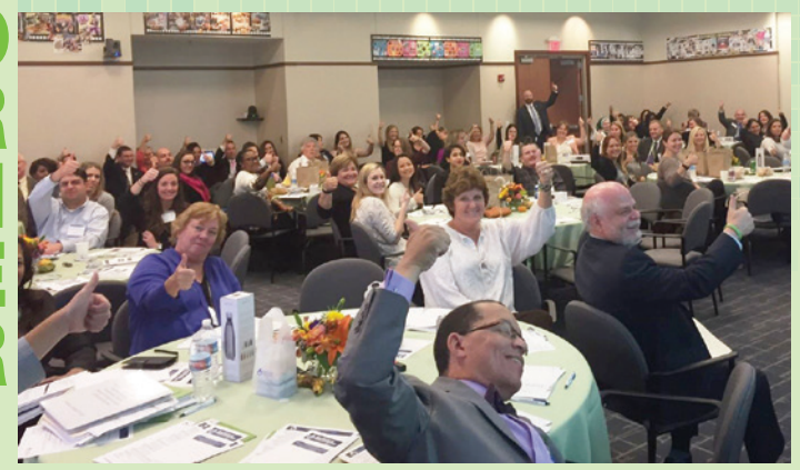
Gift of Life is expanding its highly successful Donation & Transplant Improvement Initiative beyond transplant centers to include hospitals and healthcare systems throughout the region in 2018.