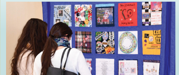
Family members view a Threads of Love Memorial Quilt.

The ability to see other (donor) families and hear other families' stories.