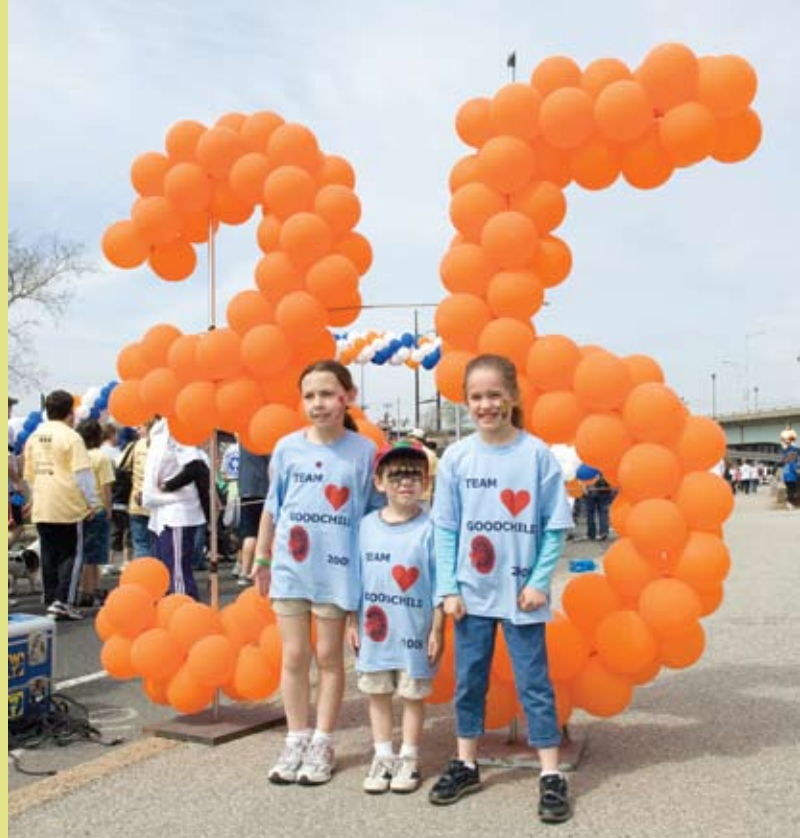
ABOVE: Gift of Life celebrated its 35th anniversary in big ways during the 2009 Dash.

In Pennsylvania, Gift of Life is teaming up with its sister organization in the western half of the state, the Center for Organ Recovery and Education (CORE), to organize the "It's On!" Campus Challenge.