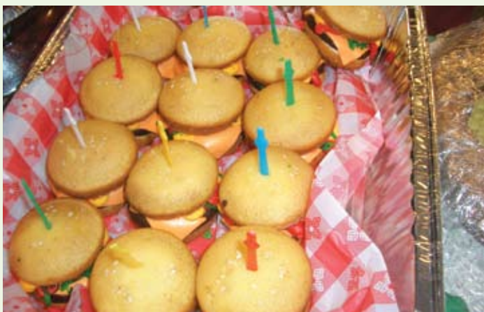
TOP: Members of the ICU Critical Crew Team pose with the cookies, pies and cakes on sale. BOTTOM: Designer cheeseburger "slider" cupcakes were the hit of the bake sale.