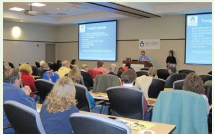
Participants at the first Volunteer Informational Meeting learn how they can help families staying at the Family House beginning this Fall.