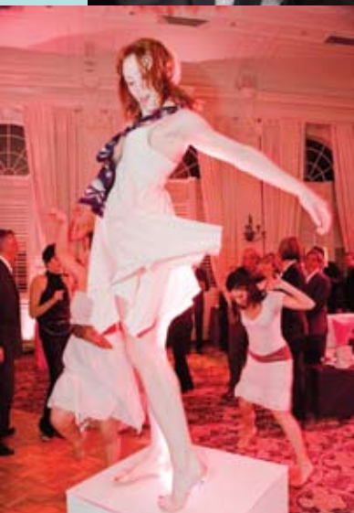
LEFT: There was no shortage of dancing during THE Party in 2009.