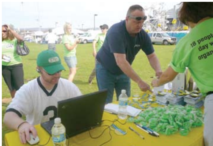
ABOVE: The Donate Life Pennsylvania booth at Penn State gets people registering online before the big game.

For more information about the Campus Challenge, check out the Donate Life PA website at www.donatelife-pa.org .