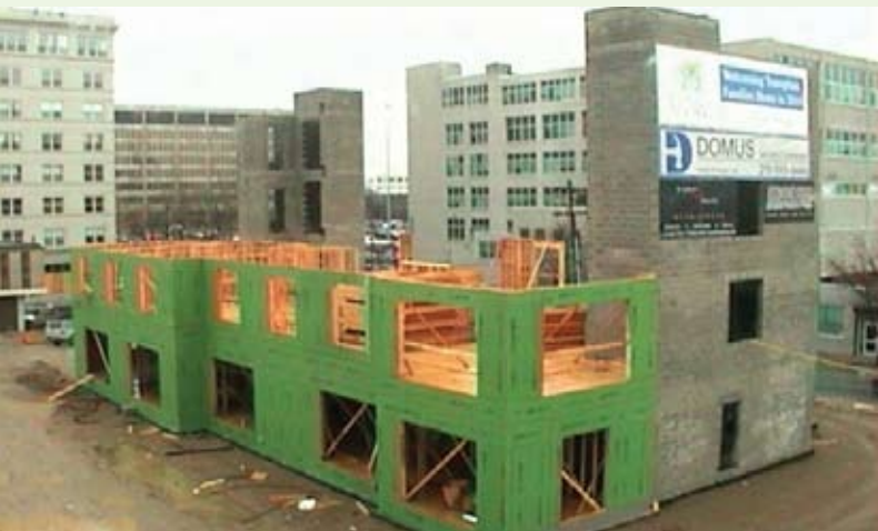
Construction on the Family House began to take shape at 4th & Callowhill this March.

Gift of Life Family House, being developed at 401-415 Callowhill, at the corner of 4th & Callowhill, however, has evolved into so much more than simply “temporary lodging.” As a result of conversations