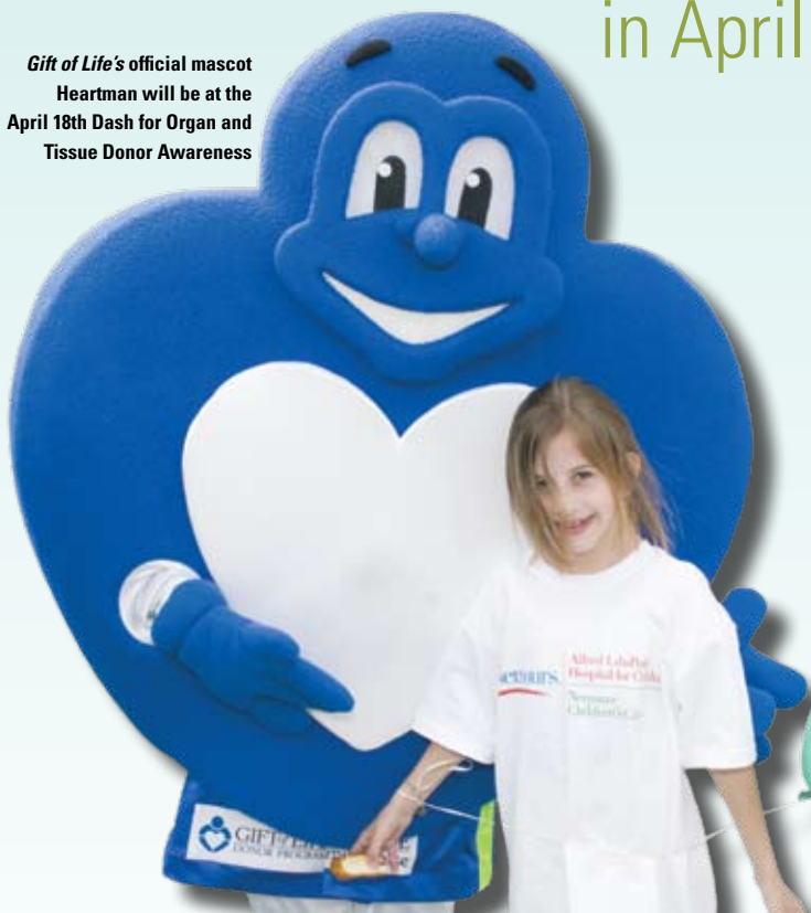
Gift of Life's official mascot Heartman will be at the April 18th Dash for Organ and Tissue Donor Awareness

Check out inside for the various events that are coming up in April!