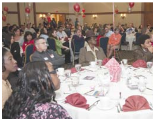
The crowd of 150 people gathered for the annual Living Donor Recognition Ceremony listen to the afternoon's speakers.

During the afternoon, donors and their recipients received an honorary pin and a certificate from a representative of the Health Resources and Services Administration (HRSA).